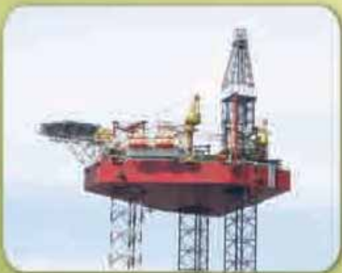
Jack Up Rig : Greatdrill Chetna