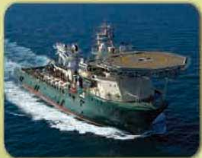
Multipurpose Platform Supply and Support Vessel : Greatship Mamta