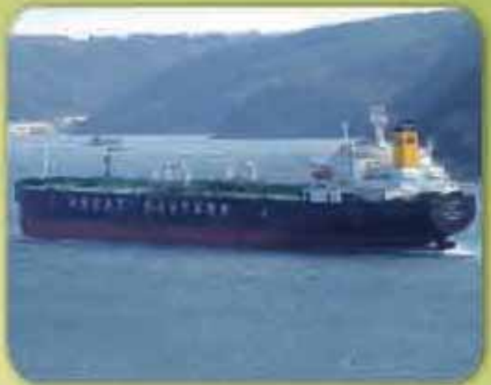
Crude Oil Carrier : Jag Leela