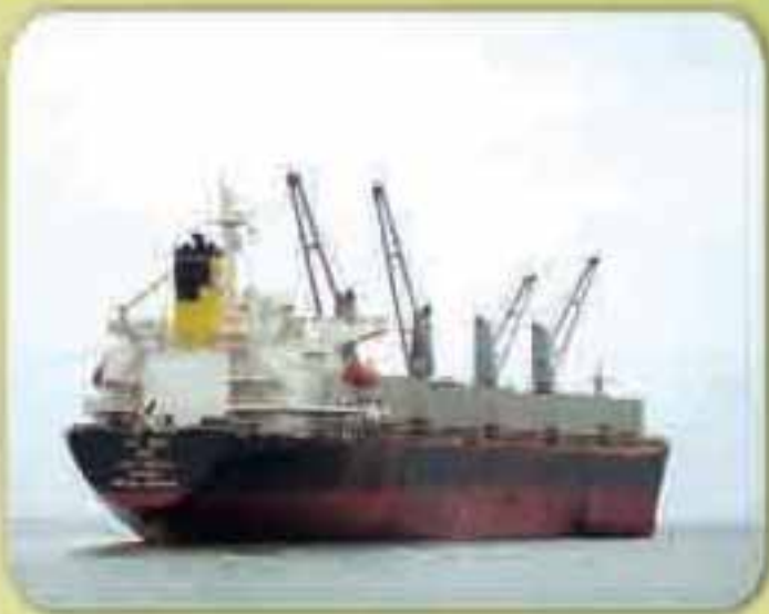
Dry Bulk Carrier : Jag Rahul